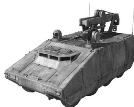
Recovery and Maintenance Vehicle (FRMV)