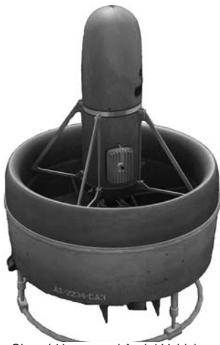
Class I Unmanned Aerial Vehicle