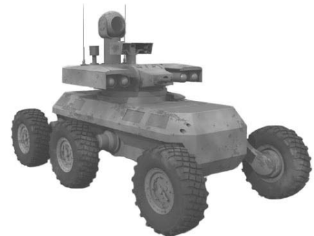
Multifunctional Utility/Logistics and Equipment (MULE) Vehicle