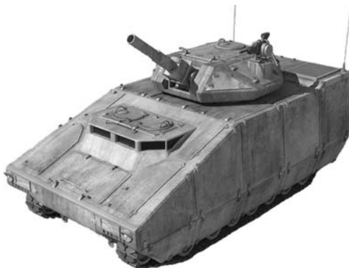
Non-Line-Of-Site Mortar (NLOS-M)